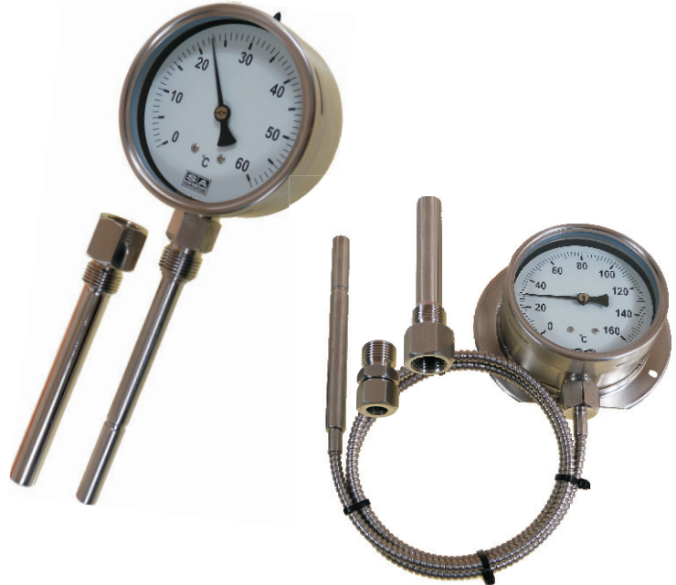
For dimensional drawing see technical section